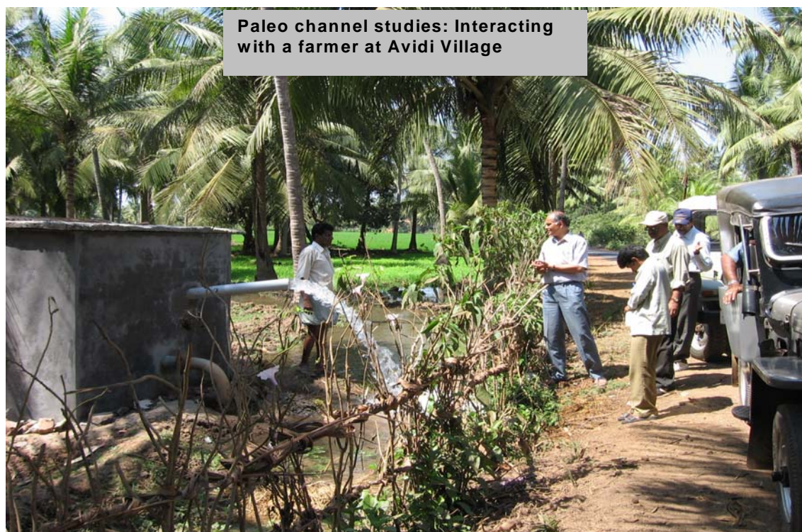
Interaction with local farmers regarding Paleo Channel Study in Central Godavari Delta System